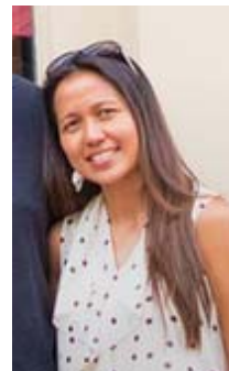
Social Media / Photographer Mae Fromm