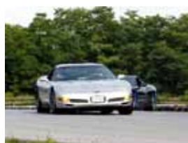
George Kerns cranks it up coming out of turn seven a the first NVCC HPDE

HPDE event was a great day for NVCC. With NCCC now requiring a minimum at least one high speed drivers school with a passing grade to be considered for a high speed license it was decided to host an event at Summit Point for club members. A variety of equipment showed up from older vettes to BMWs,