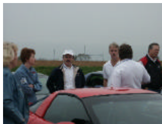
Now let's get organized!