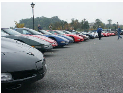
Line 'em up!