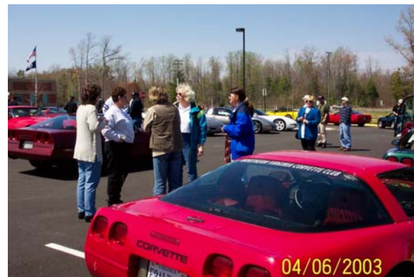
More NVCC'rs at the Capt. Billy Cruise

History 50 years of Corvettes—what was the name of the hotel that the 1953 prototype made it's debut??