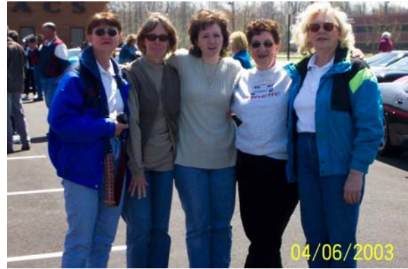
NVCC'rs at the Capt. Billy Cruise