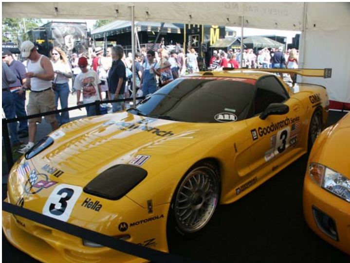
NOT an Earnhardt Corvette!