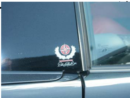
Logo on the roof pillar.

A winner for the one of a kind Earnhardt Corvette Z06E will be drawn on June 30, 2003 as part of the 50th Anniversary Celebration activities at the Museum. For more information on being a part of the National Corvette Caravan/50th Anniversary Activities visit: http://www.nationalcorvettecaravan.com/